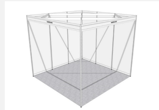
PICTURED: 3x3 enhanced shell scheme booth